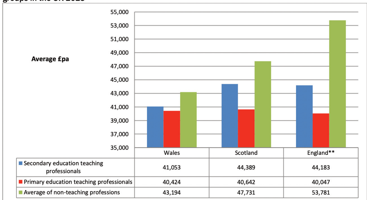
Figure 7: Average gross annual earnings of teachers and combined selection of professional groups in the UK 2023*

2.7 It is clear that over time, the position of both primary and secondary teachers' pay, compared to other non-teaching professions, improved considerably from 2008 to 2015, but it has worsened in 2023. Both graduates and current teachers therefore have chosen alternative career paths that offer much more attractive salaries.